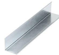
Galvanizes Angle Bar